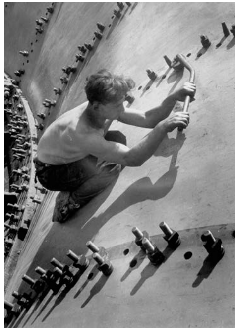
Man tightening the large nuts on the turbine shell, 1930

Syracuse, NY- The Syracuse University Art Galleries, in collaboration with the SU Libraries' Special Collections Research Center, is pleased to present Margaret Bourke-White: Moments in History 1930-1945 , an exhibition of over 180 vintage photographs taken in the Soviet Union, Czechoslovakia, Germany, England and Italy in the 1930s and 40s. The exhibition will also feature original Life and Fortune magazines, in addition to correspondence related to Bourke-White's photography and projects. This is the first of a series of exhibitions that Syracuse University Art Galleries will present in the 2014-2015 academic year celebrating women in the arts. A complementary exhibition entitled, Context: Reading the Photographs of Margaret Bourke-White , will be presented at the Special Collections Research Center, also opening August 19 th .